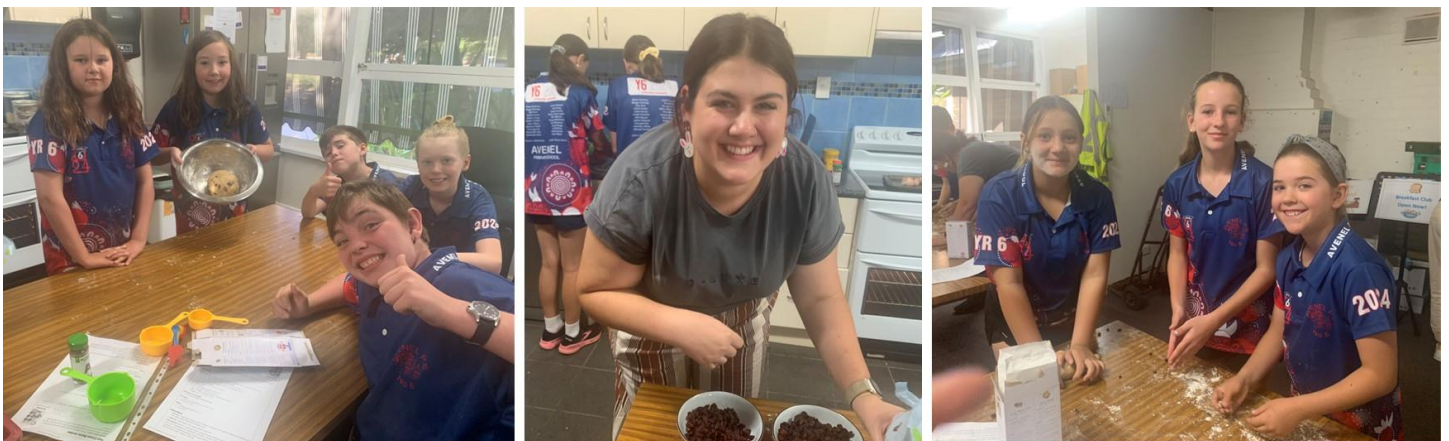
Hot cross buns, hot cross buns, 1 a penny, 2 a penny, hot cross buns. Gr 6 students enjoyed making (and eating) hot cross buns at the end of last term.